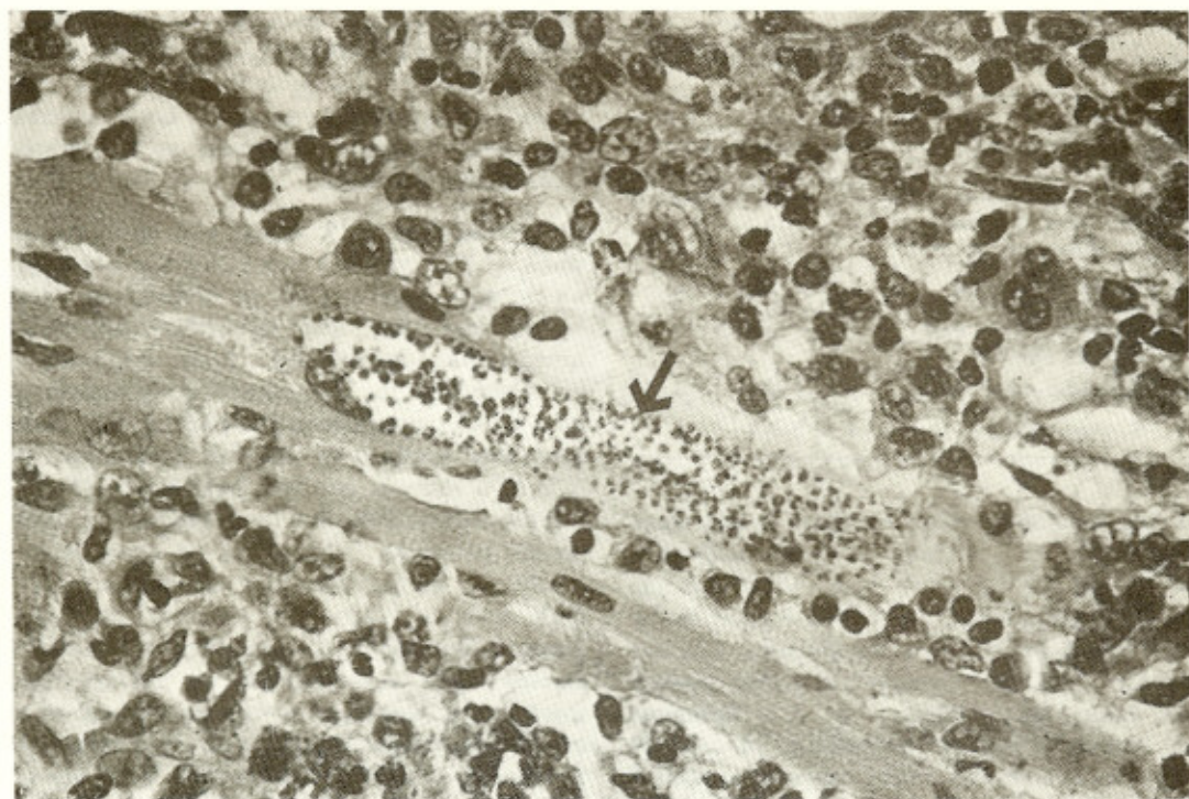
Fig. 2 — Myocardium from dog infected with T. cruzi with intracellular cluster of T. cruzi amastigotes (arrow) and mononuclear cell infiltrate in the interstitium (H. & E., 408 X)